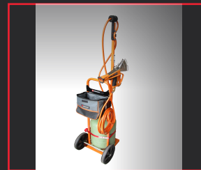
936 GAS BOTTLE TROLLEY