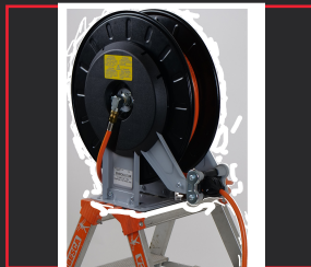
GAS HOSE REEL